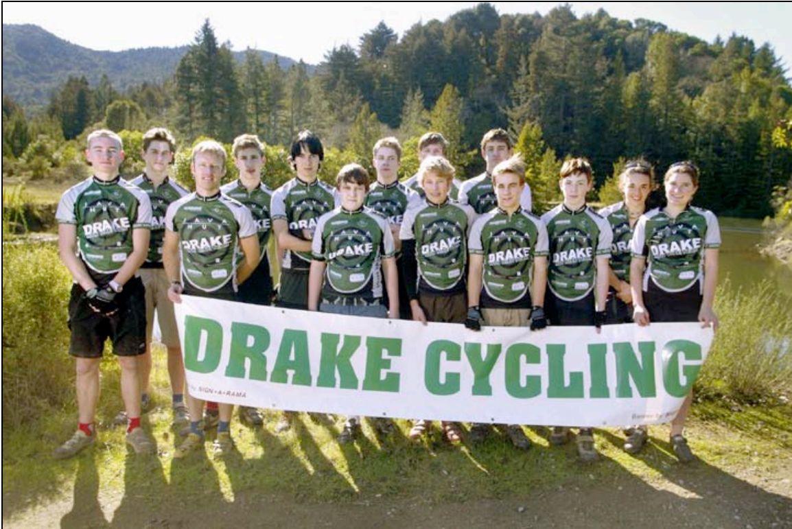
The 2004 Drake High School Mountain Bike Team

Proposal for Cannondale Bicycles – 3/2004